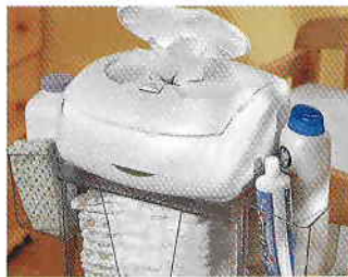
Wipe Warmer & Diaper Organizer