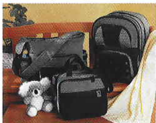
Tote, Mini & Backpack Diaper Bag