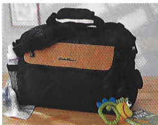
Full-Size Diaper Bag